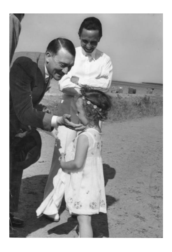
Figure 1: Hitler with Joseph Goebbels' daughter, 1932.

reparations.<sup>6</sup> In response, Germans felt distressed and, due to its demands, hated the Treaty of Versailles. In a situation like this, where people need a savior, is where figures like Hitler appear.