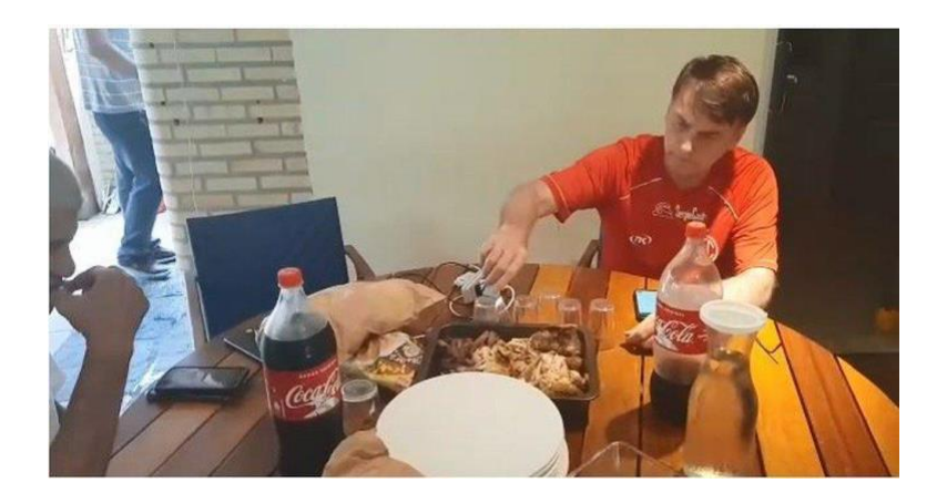
Figure 3: Bolsonaro eating.

History is cyclical. The debate of whether history follows a cycle is not contemporary. Many scholars like Arthur Schlesinger, in Paths to the Present , Arthur Schlesinger Jr, in The Cycles of American History , and Ibn Khaldun, a fourteenth to fifteenth century Arab philosopher, discuss whether historical events are deemed to repeat themselves or if this is some sick joke of fate.<sup>28</sup> I, however, accept the proposition that history is cyclical. I believe that history exists to teach us a lesson, and we, as a society, can only succeed if we learn from the mistakes of the past. If maybe Hitler had paid more attention to Napoleon, he might have succeeded in Russia. Maybe, if we had learned something from the 1918-19 Influenza pandemic, we might have had an easier time with COVID-19.