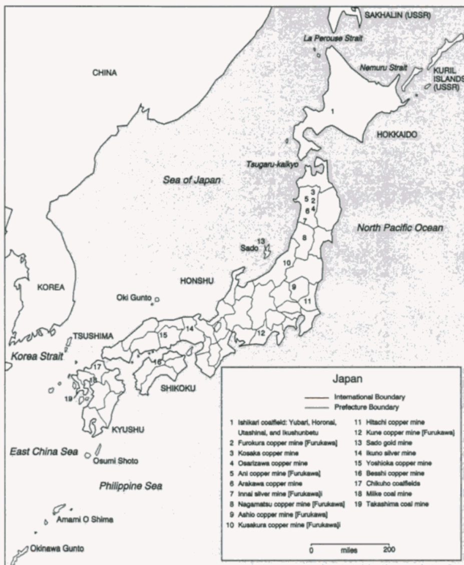
Figure P.1. Location of principal mines in Japan, ca. early twentieth century.